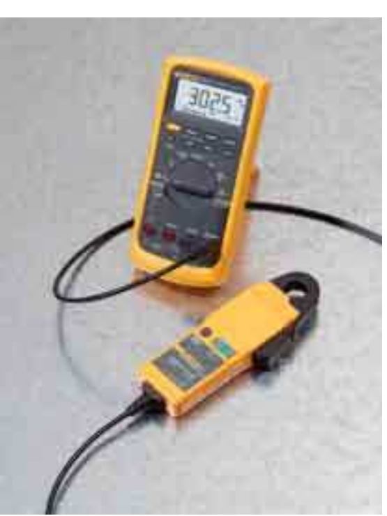
i30 connected to a Fluke 87V Digital Multimeter.

Ordering information i30 AC/DC Current Clamp